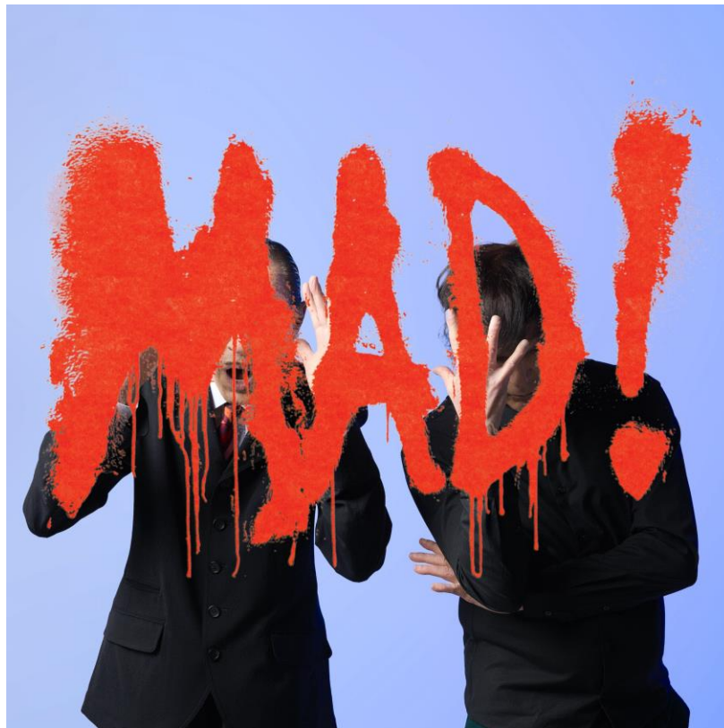
MAD! Album Artwork